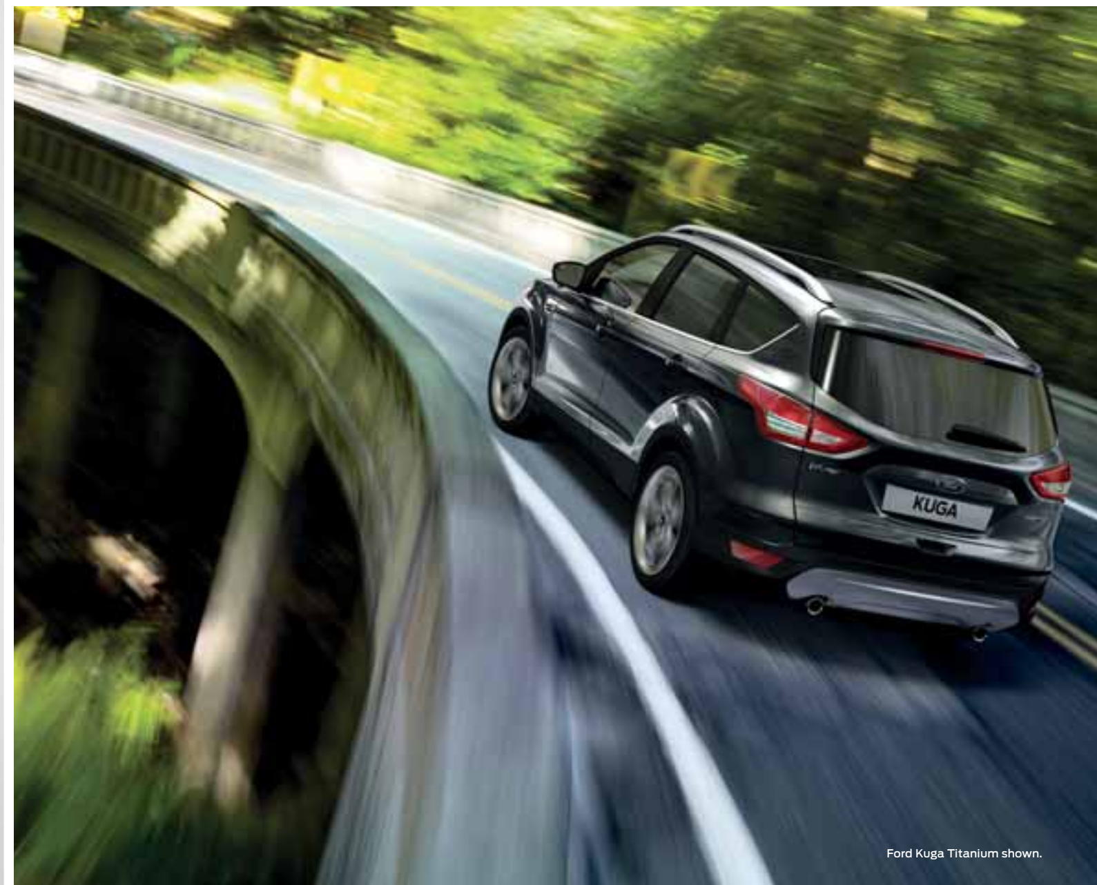
Ford Kuga Titanium shown.

SYNC™ is there for you when you need it most. If you're in an accident that deploys the airbags or activates the fuel pump shut off, Emergency Assistance uses your paired and in range mobile phone, to dial emergency services and provides them with your precise GPS coordinates.