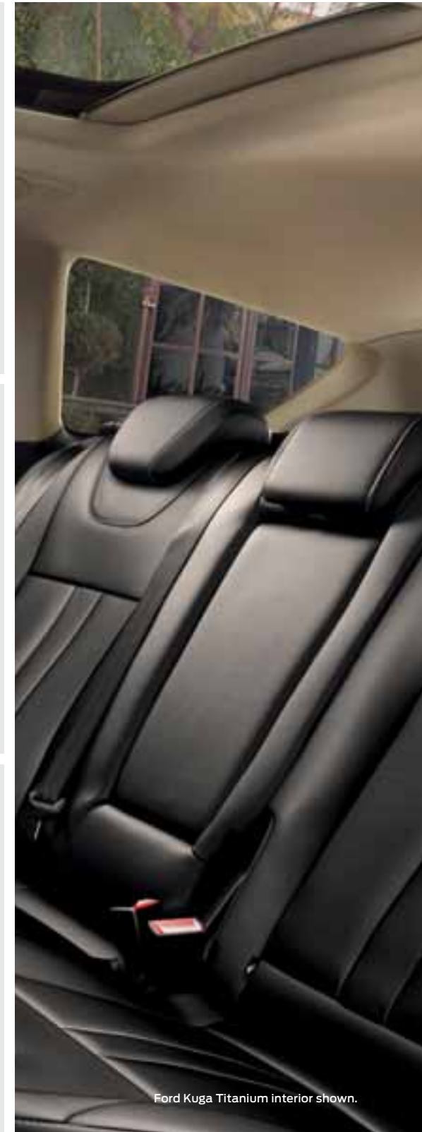
Ford Kuga Titanium interior shown.