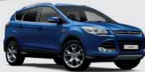
Deep Impact Blue*