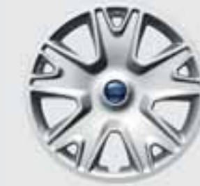
17" x 7.5" steel wheel

Seat insert: Prada in Charcoal Black Seat bolster: Lux in Charcoal Black Instrument panel: Charcoal Black