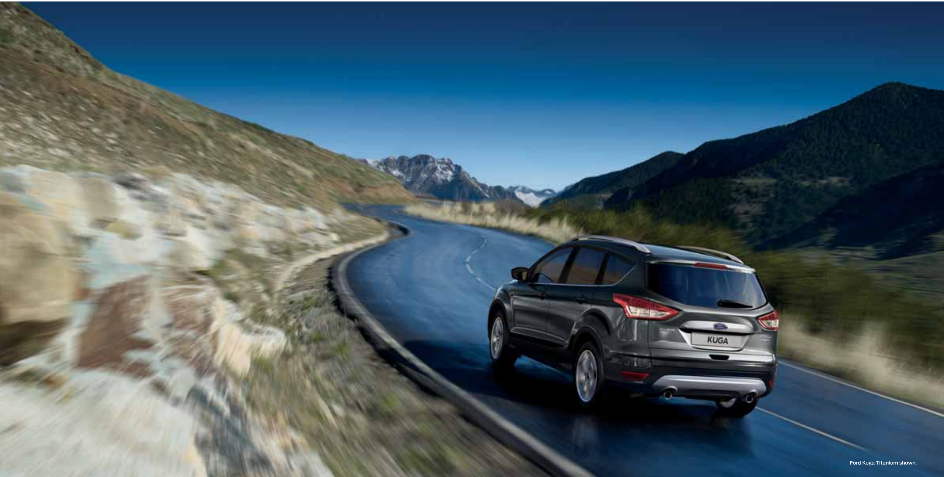
Ford Kuga Titanium shown.

The Ford Kuga brings you the latest in EcoBoost petrol and diesel engine options with smart fuel-saving technologies, delivering impressive fuel-efficiency without compromising power.