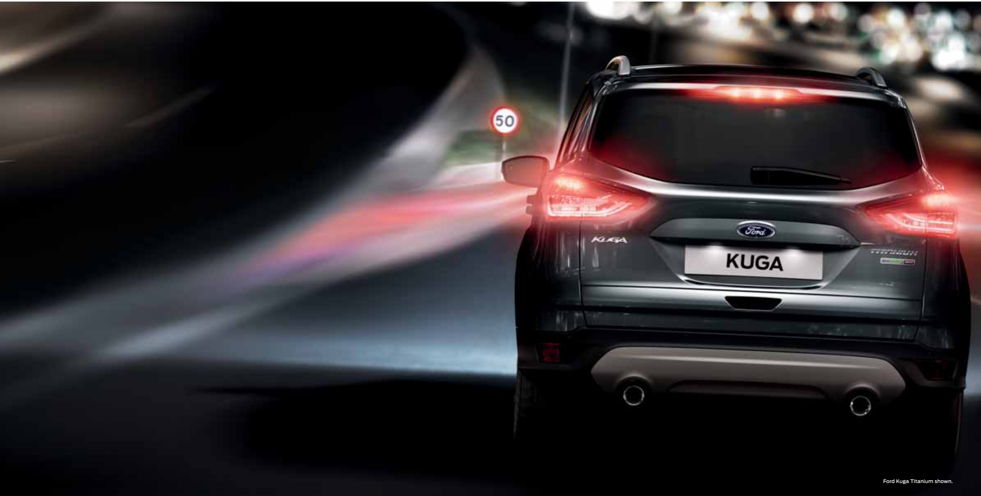
Ford Kuga Titanium shown.

The Ford Kuga incorporates some of the most advanced safety features available. | 18 Not only to help protect you, but to help prevent the need for protection in the first place. |