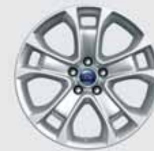
18" x 7.5" alloy wheel

Seat insert: Prada in Charcoal Black Seat bolster: Torino Leather in Charcoal Black Instrument panel: Charcoal Black