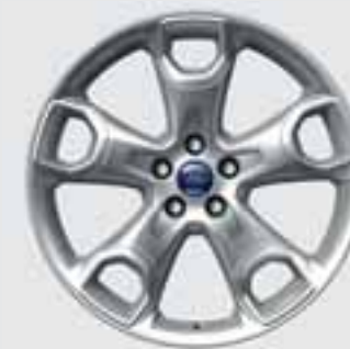
19" x 8" alloy wheel

Seat insert: Torino Leather in Charcoal Black Seat bolster: Torino Leather in Charcoal Black Instrument panel: Charcoal Black