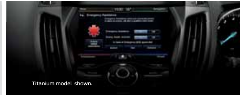
Titanium model shown.

The Ford Kuga's highly advanced technology provides you with the very best levels of protection. And it helps make your life simpler and stress-free too.