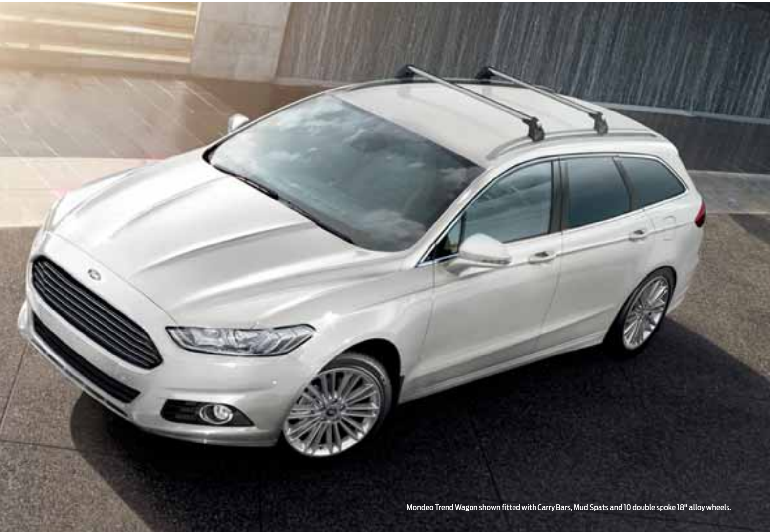
Mondeo Trend Wagon shown fitted with Carry Bars, Mud Spats and 10 double spoke 18" alloy wheels.

Like the hem of a perfectly tailored suit, your choice of vehicle accessories are the final details that make sure your Mondeo has everything it needs to suit you and your lifestyle.