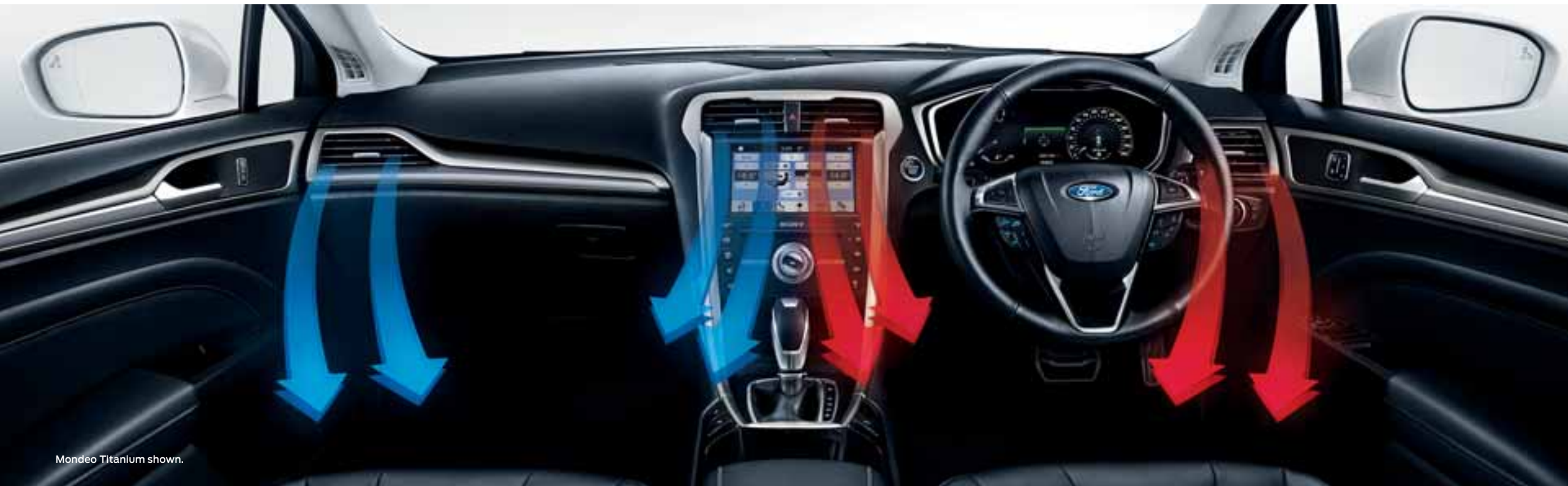
Mondeo Titanium shown.