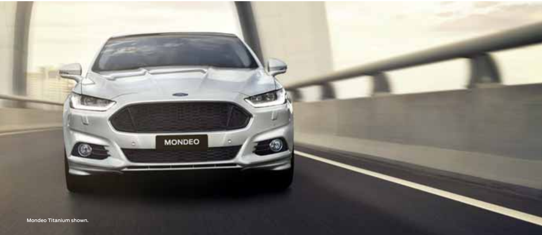
Mondeo Titanium shown.