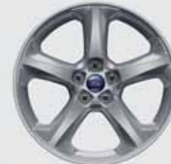
18" x 8.0" alloy wheel Hatch & Wagon

Seat Insert: Perforated Miko Charcoal Black Seat Bolster: Salerno Leather Charcoal Black