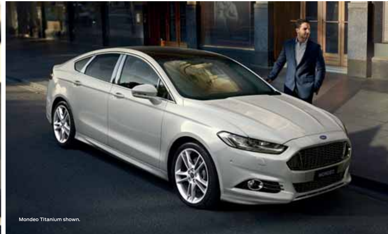
Mondeo Titanium shown.

Wherever you look inside the Mondeo's cabin, you'll find a perfect blend of form and function. Sleek, elegant interiors house the Mondeo's intuitive features, while the ergonomic styling makes sure they're always within reach.