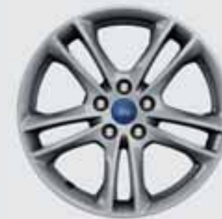
17" x 7.5" alloy wheel Hatch & Wagon

Seat insert: Cloth Ebony Seat bolster: Cloth Ebony