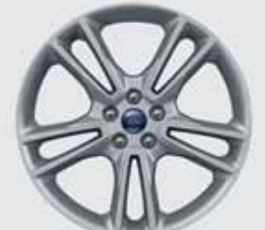
19" x 8.0" alloy wheel Hatch & Wagon

Seat Insert: Salerno Leather Charcoal Black Seat Bolster: Salerno Leather Charcoal Black