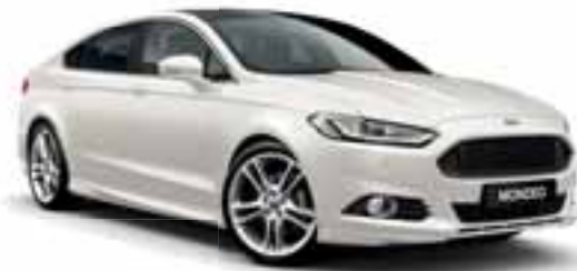
White Platinum Tri Coat*